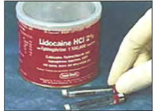
Don't eat if your mouth is numb

Your lips, teeth, and tongue may be numb for several hours after appointments in which we've used an anesthetic. Avoid chewing anything until the numbness has completely worn off.