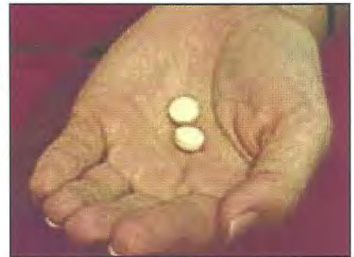
Take medication as directed

It's common, and not a problem, for a small portion of your temporary filling to wear away or break off between appointments. If the entire filling falls out, or if a temporary crown comes off, call us so that we can replace it.