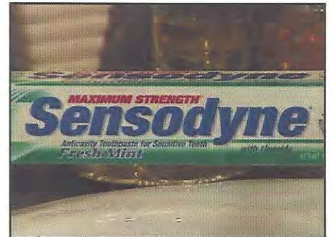
Use desensitizing toothpaste