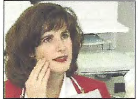
Avoid chewing until numbness wears off

Call our office if your bite feels uneven, you have persistent sensitivity or discomfort, or if you have any questions or concerns.